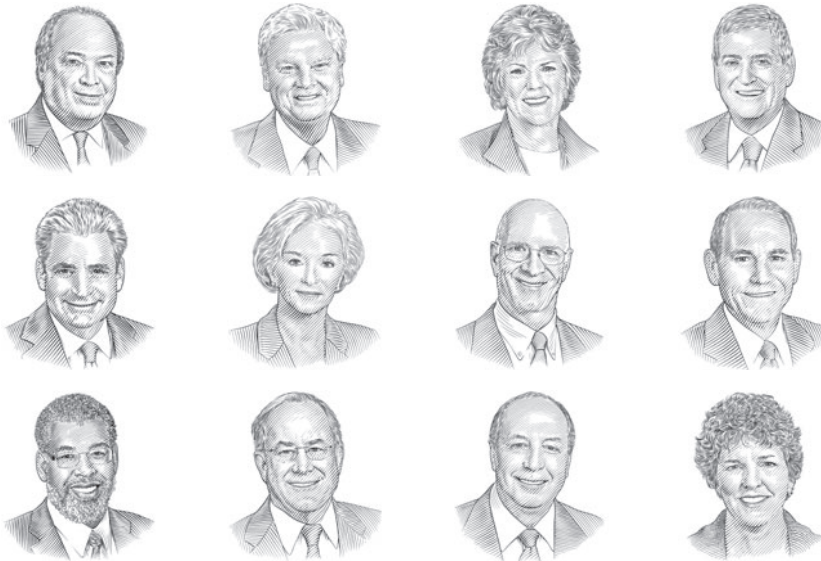
Left to right from top left